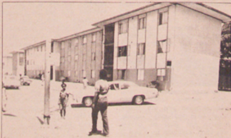
View of San Antonio Villa housing projects.