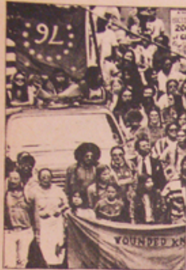
Native American contingent in last summer's July 4th Coalition protest.