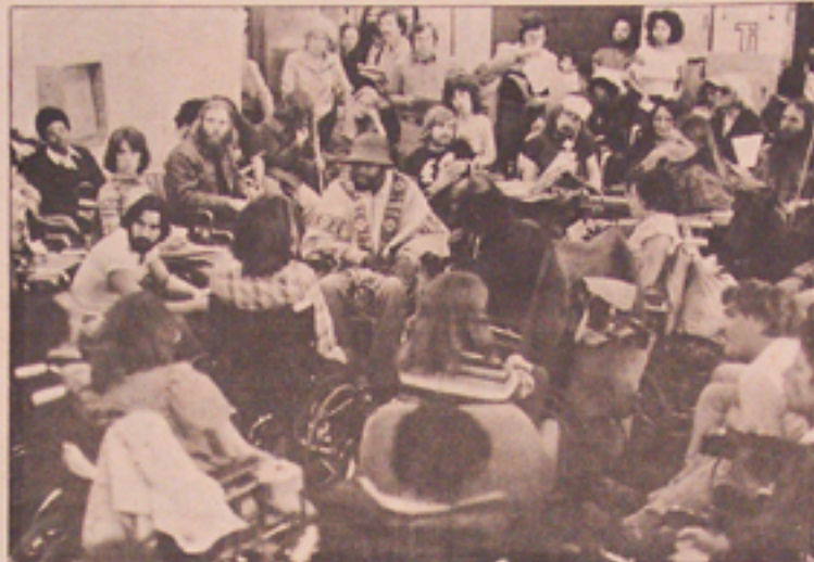
Militant disabled citizens jam San Francisco HEW office.

Further, the American Coalition of Citizens with Disabilities (ACCD) - the ad hoc organization which led eight simultaneous