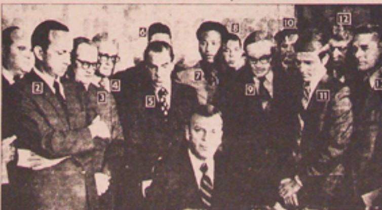
Former Cook County State's Attorney EDWARD HANRAHAN with police officers who carried out the murderous raid against BPP leaders Fred Hampton and Mark Clark.