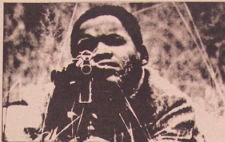
SWAPO freedom fighter takes aim at racist White minority South Africa regime.

GAROE: If South Africa wants to resolve the question of Namibian independence by peaceful means, we would be willing to participate in elections. But we have made the condition that the U.N. or OAU must supervise these elections, not the