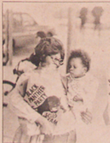
BPP Free Food Program.