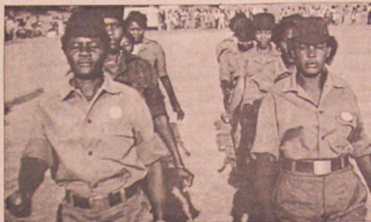
SWAPO women militants.

Q: Was it because of this need to bring SWAPO to the conference table that the South Africans tried to divide your organization?