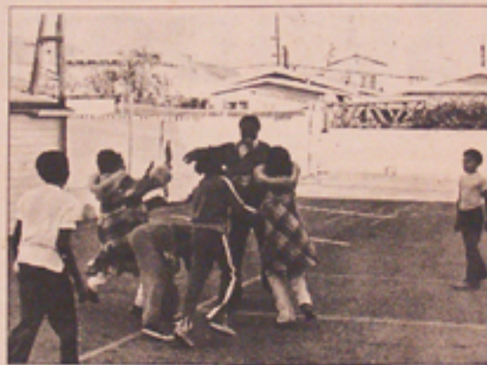
OAKLAND COMMUNITY SCHOOL

Provides new, stylish and quality clothing free to the people.