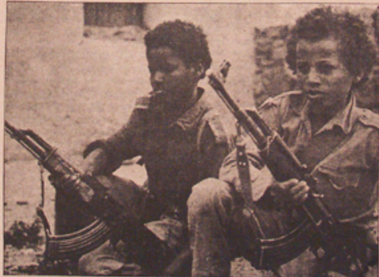
Youthful Eritrean liberation fighters.

•The complete equality of women with men in the economic,