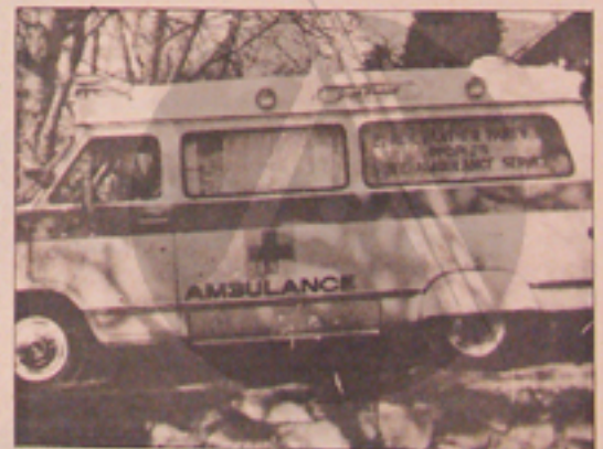
FREE AMBULANCE PROGRAM

Provides 24-hour child care facilities for infants and children between the ages of 2 months and three years. Youth are engaged in a scientific program to develop their physical and mental faculties at the earliest ages.