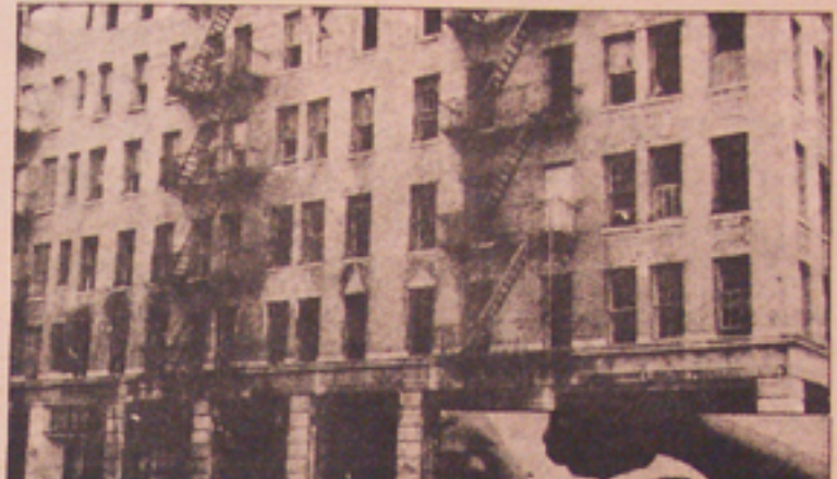
Deteriorating inner-city living conditions are slowly but steadily draining the strength of Black youth.

NOW, THEREFORE, BE IT RESOLVED that the United States Conference of Mayors calls upon the Administration and