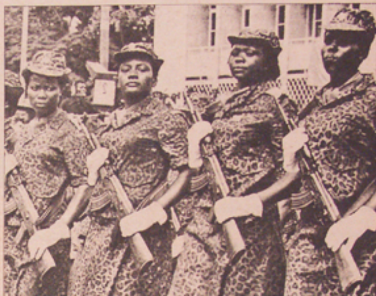
Zairean women troops.

The Carter administration announced last Monday that the U.S. would send an additional $13