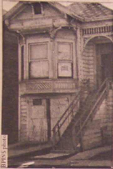
Abandoned Oakland home.