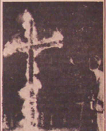
KKK cross burning.

As the civil war intensified, the Union forces became almost desperate for more manpower in its battle with the South. The gradual emancipation of the slaves became the only recourse. Consequently, Congress began the process by passing a bill which ended slavery in Washington, D.C., on April 16, 1862.