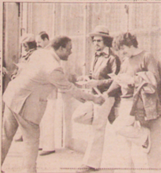
HAROLD WASHINGTON , a state senator who has publicly blasted police abuse in Chicago, pictured while campaigning for the city's mayoral seat.

In March, 1976, it was revealed that the FBI had concealed at least 80 per cent of the files on Fred Hampton and the Black Panther Party which the federal court had ordered turned over in the $47.7 million civil lawsuit filed by the families of Fred Hampton and Mark Clark and the survivors of the fatal December 4, 1969, police raid. At this time Senator Washington (then a state assemblyman) along with state Senator Richard Newhouse, wrote a letter to then Attorney