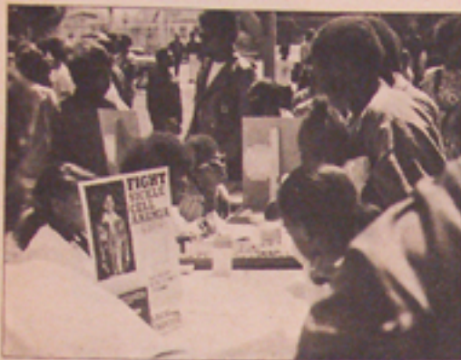
FREE SICKLE CELL ANEMIA TESTING

"All these programs satisfy the deep needs of the community but they are not solutions to our problems. That is why we call them survival programs, meaning survival pending revolution." —Huey P. Newton