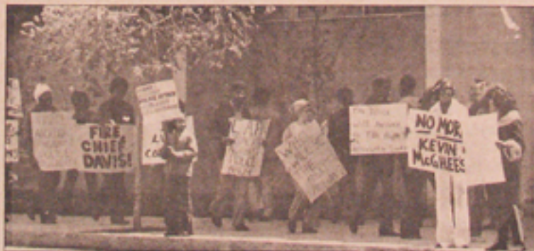
CAPA protest against Los Angeles police killings.