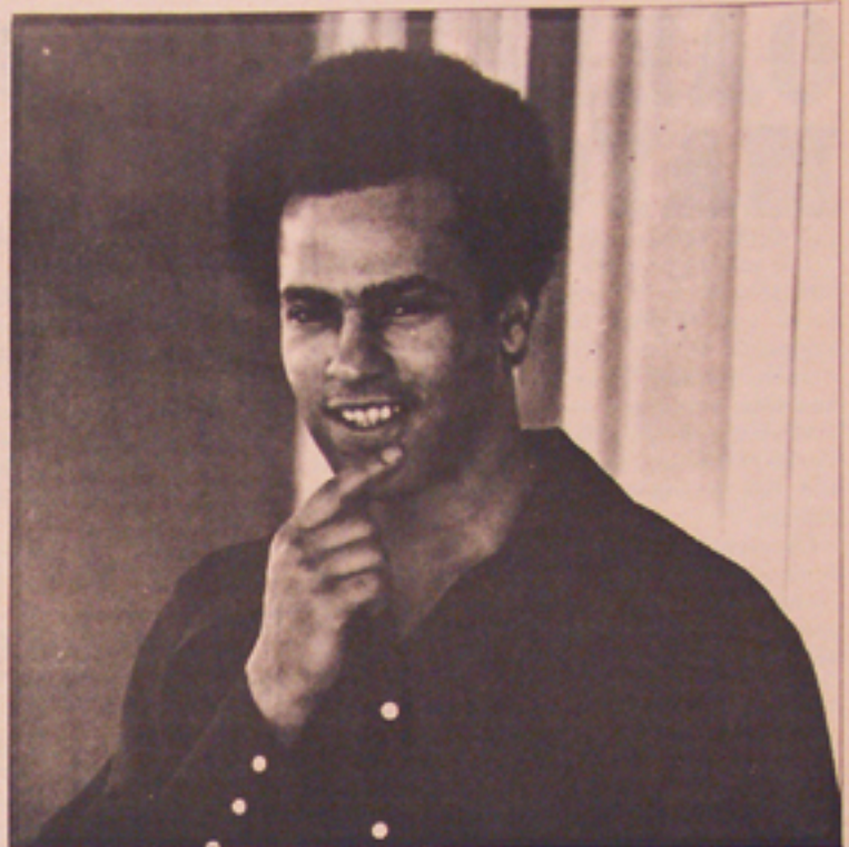
HUEY P. NEWTON

The guards would simply threaten to put the political offender on a bus and send him away from his lover. These threats always worked. As a matter of fact, many guards were themselves homosexuals. Often, as I showered, a guard would stand in the doorway, talking, looking not at my face but at my penis, and say, "Hey, Newton, how you doin' there, Newton? Wanna have some fun, Newton?" I laughed at them.