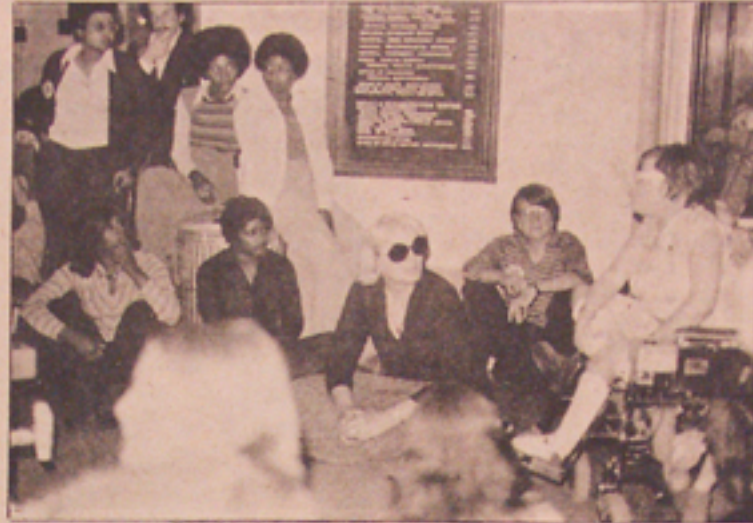
Disabled persons hold strategy session.

In addition, local Congressman George Miller visited the demonstrators on Easter Sunday, and by way of expressing his support said that he would call for federal hearings on Section 504 as soon as possible. These hearings are now scheduled for Friday, April 15, with the rally planned as a