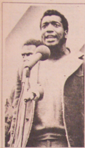
Fallen Comrade FRED HAMPTON.