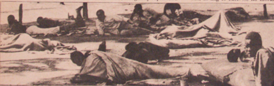
Zimbabwean refugee camp.