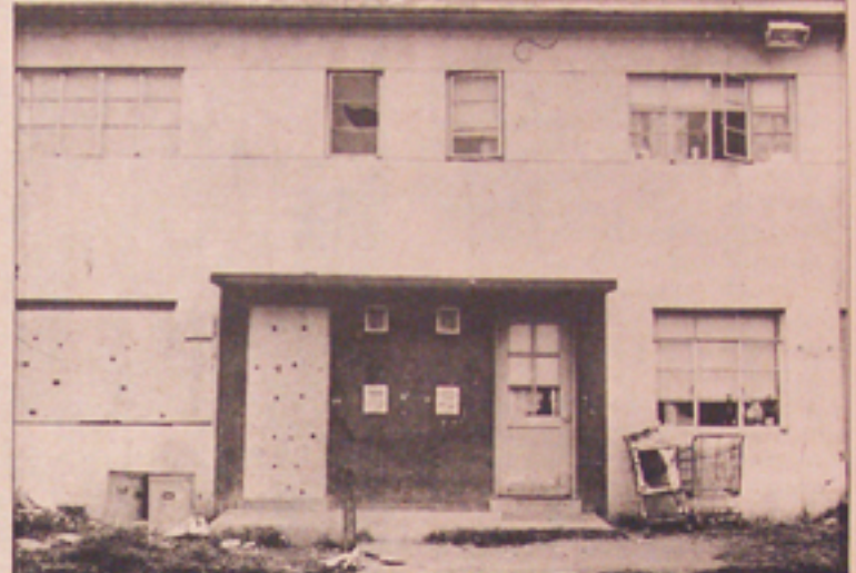
Black and poor tenants are forced to pay exorbitant rents for substandard housing.

"Without each of these programs, landlords and real estate speculators will increasingly be able to raise the price of rental