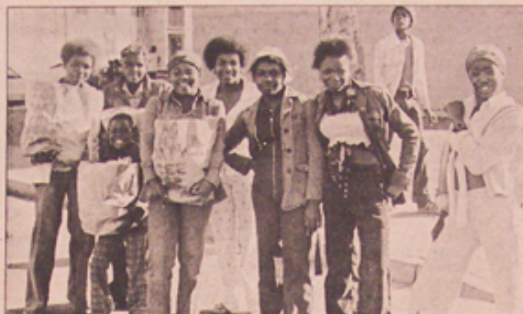
Happy participants in BPP Free Food Program, which provides assistance to those neglected by local, state and federal agencies.

Citing President Carter's public commitment to reordering federal spending priorities and the National Democratic Platform