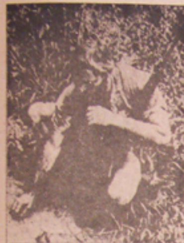
U.S. mercenary serving in Rhodesian armed forces.