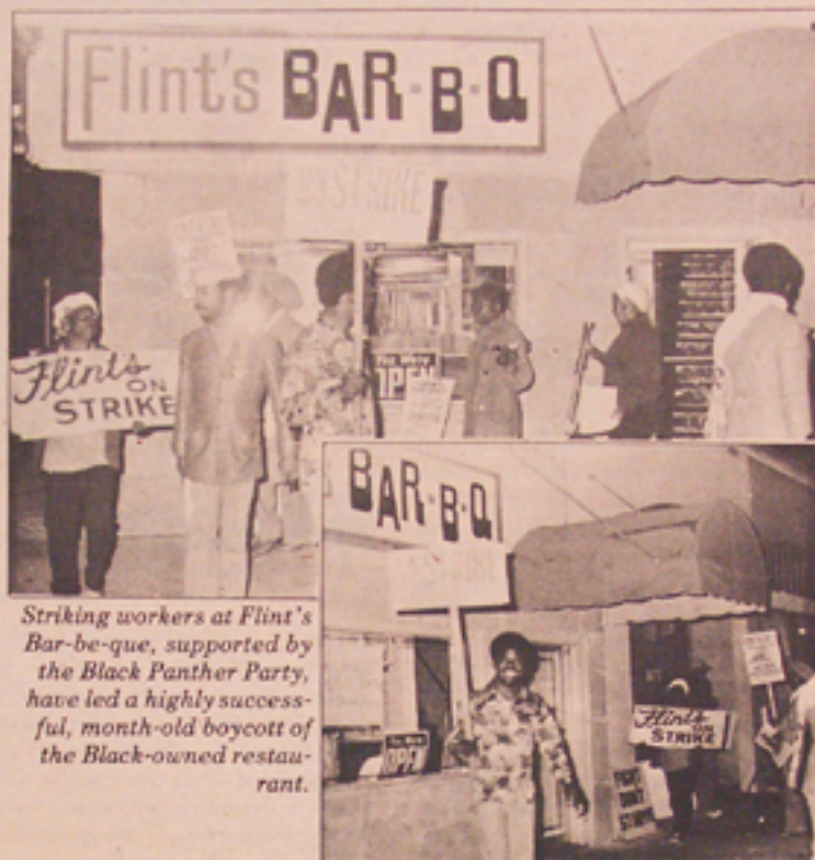
Striking workers at Flint's Bar-be-que, supported by the Black Panther Party, have led a highly successful, month-old boycott of the Black-owned restaurant.

Ms. Herold said that on a typical weekend, Flint's grosses