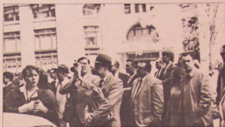
Police conducting surveillance on protest rally. Recently a FBI supervisor was indicted for illegal spying.