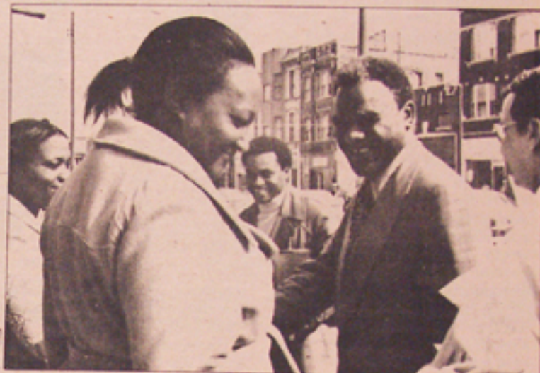
Popular Black Chicago mayoral candidate HAROLD WASHINGTON campaigning.