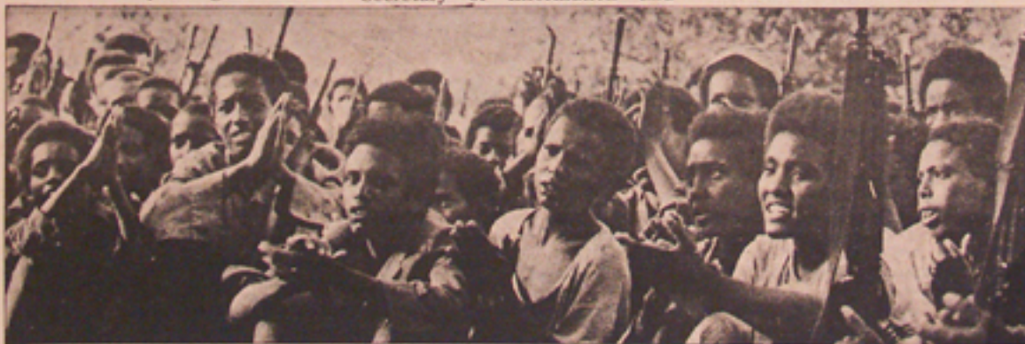
Revolutionary Eritrean youth.