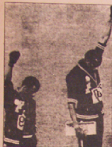
Famed "Black Power" protest at Mexico Olympics.

This basketball style "ping-pong diplomacy" will be continued with a Cuban national basketball team expected to tour the U.S. later this year. □