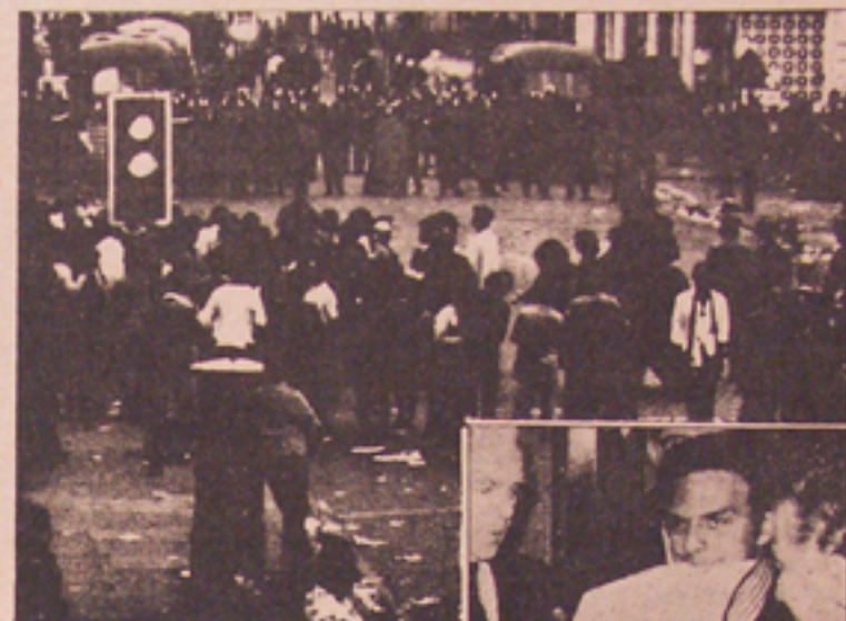
Anti-racism protest in London (above) and U.N. Ambassador ANDREW YOUNG, currently under fire for his stinging criticism of discriminatory practices in Britain.